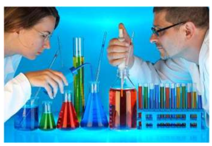
Providing ISO 17035 consulting and Training services across the world.